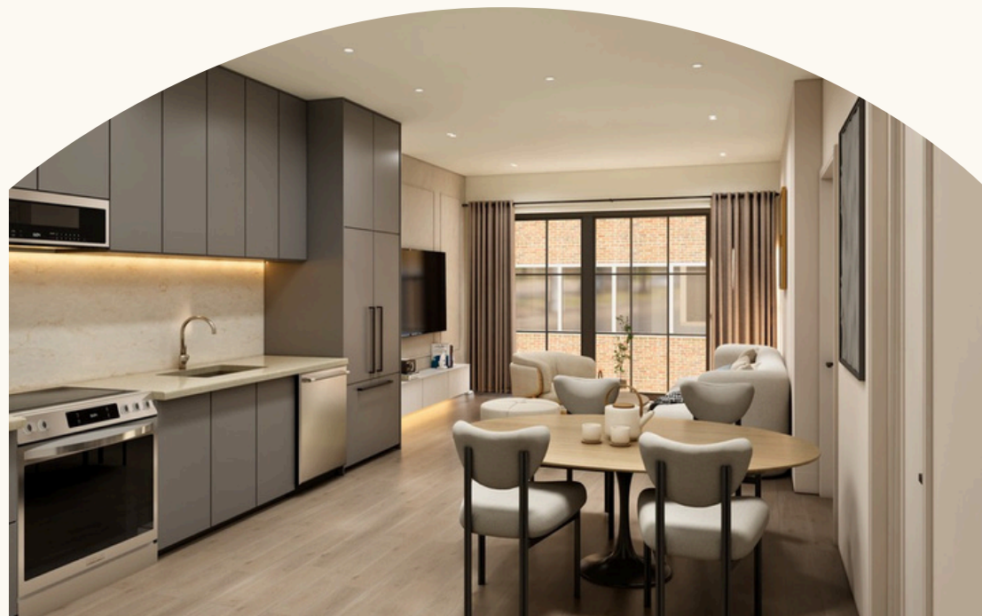
1 BEDROOM + 1 BATHROOM

CLICK on the layout below for a 3D walkthrough: