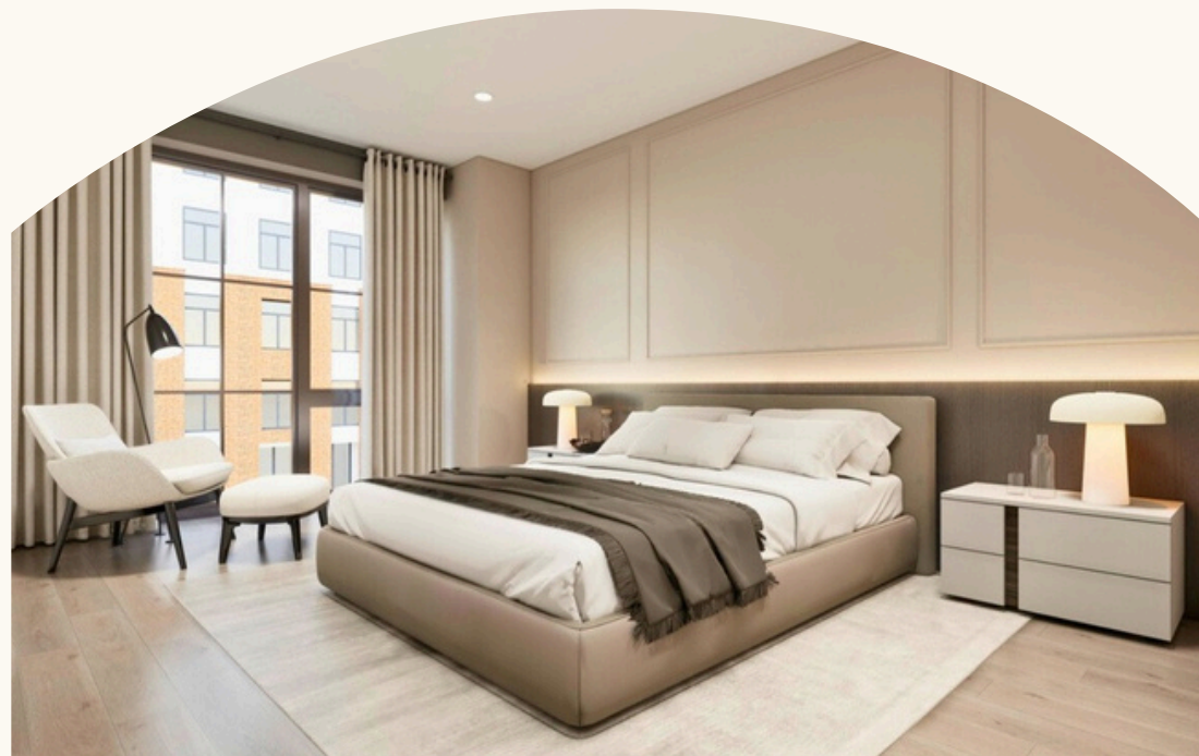
1 BEDROOM + 1.5 BATHROOMS