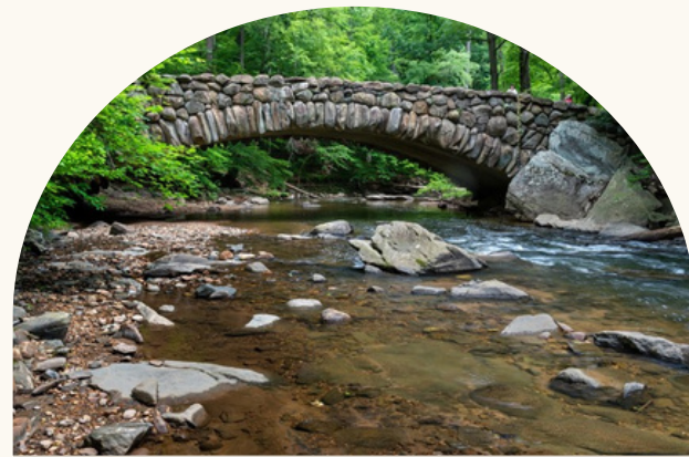
Rock Creek Park

Located in one of the city's most vibrant neighborhoods, The Duke puts you steps away from restaurants, shops, parks, and public transportation. Whether you're exploring the local dining scene or commuting to work, everything you need is just moments away. Live in the heart of the city and experience the best of urban living.