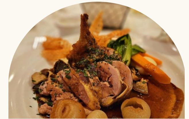
Michelin Star Restaurants

Georgetown is one of Washington D.C.'s top shopping destinations, featuring a charming mix of high-end designer outposts and local boutiques.