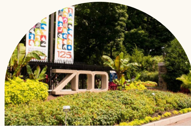
Smithsonian National Zoological Park

It offers visitors the opportunity to escape the bustle of the city and find fresh air, majestic trees, wild animals, and thousands of years of human history.