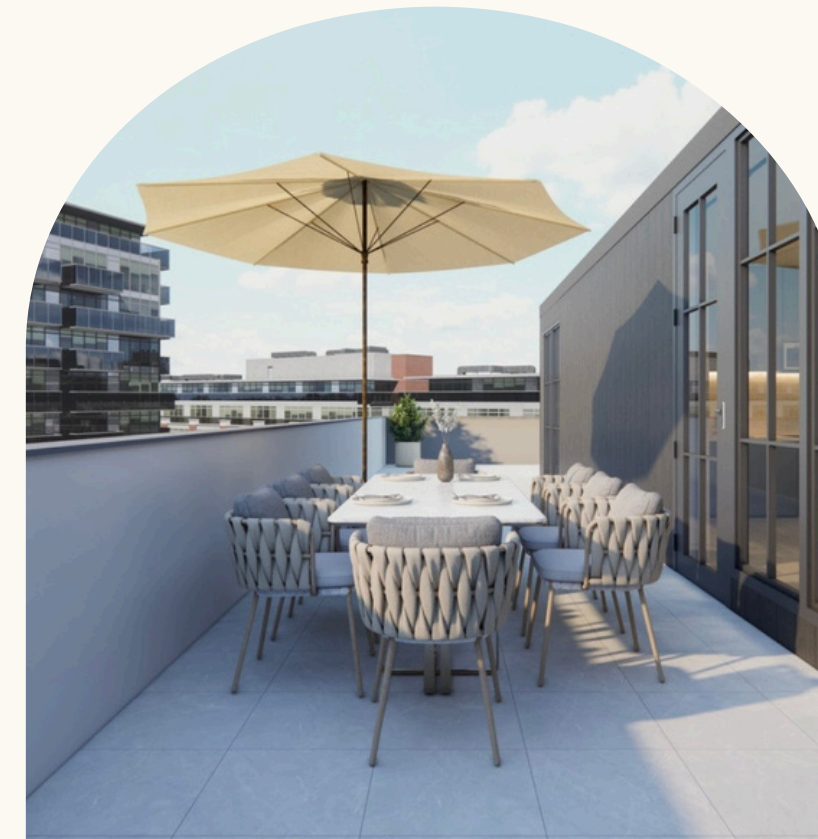
World Class Retail

An all day Bistro by a James Beard award nominee, a cocktail bar by a Michelin Star mixologist and a beautifully designed court-perfect for enjoying a cup of coffee, dinner or just reading a good book.