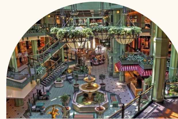
Georgetown - Luxury Shopping

The White House is both the home of the President of the United States and his family, and a living museum of American history.